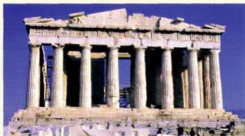
The Parthenon was built in the 5th century BC. It is visited by thousands of tourists every year.

We form the passive with the verb to be and the past participle of the main verb.