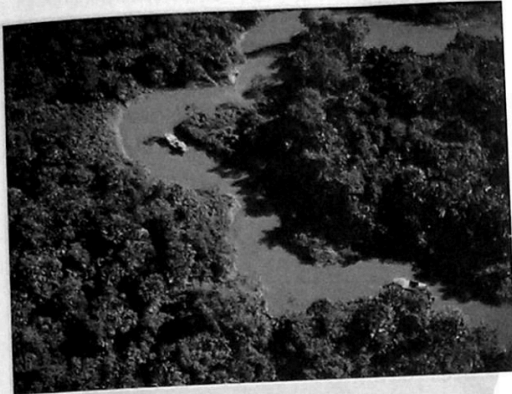
Sharks, stingrays and crocodiles: swimming the Amazon at 52

5 Read about Martin Strel and write the verbs in the past simple or the present perfect.