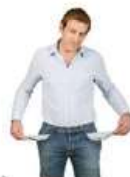
5 He's turned his pockets .....