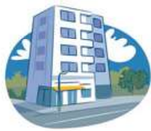
1 a block of flats .....