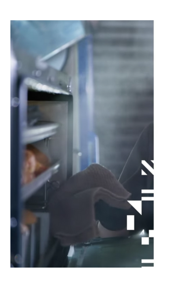
It's baked into the recipe of a language.